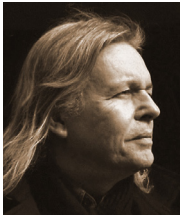
SIR CHRISTOPHER HAMPTON

BAFTA and Oscar winning writer-director, Palme D'or nominee