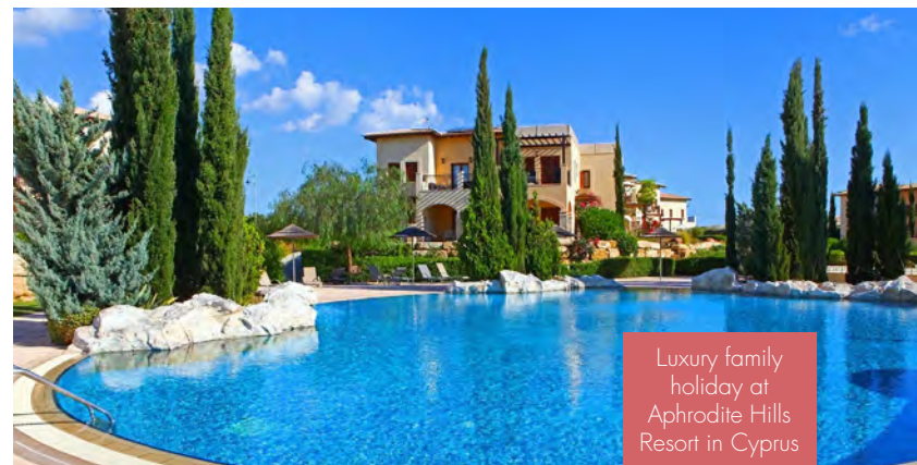
Luxury family holiday at Aphrodite Hills Resort in Cyprus