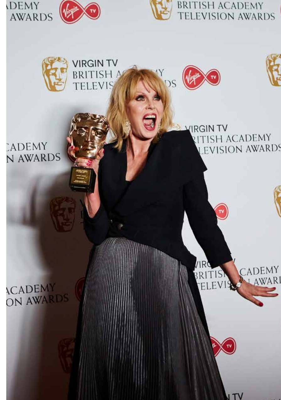
Joanna Lumley thinks receiving the Fellowship at the Television Awards is absolutely fabulous, darling!

BAFTA Media Technology (BMT) continued to develop its commercial offering surrounding our internally generated software products. BAFTA Awards Entry System and Source2Screen were rebranded to BAFTA Nucleus and BAFTA Electron respectively, and uptake of both systems by customers continued throughout the year. BMT is a software start-up in a niche commercial space, so while it made a loss in 2017 it is expected to start generating returns in 2018. In future, it will provide an alternative income stream to support our charitable work, while also ensuring that BAFTA remains at the cutting edge of technology.