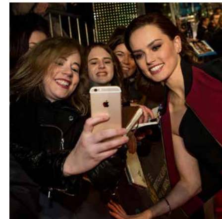
Top: Filmmaker Dee Rees delivers her Screenwriters on Screenwriting lecture; Above: On the Film Awards red carpet with Daisy Ridley