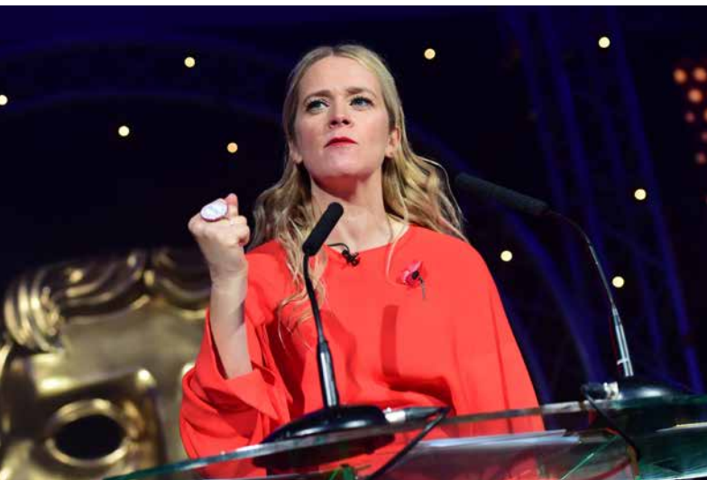
Top: Hugh Grant offers his thoughts on his career for our A Life in Pictures strand; Above: Scotland Awards host Edith Bowman sporting a rather timely ring