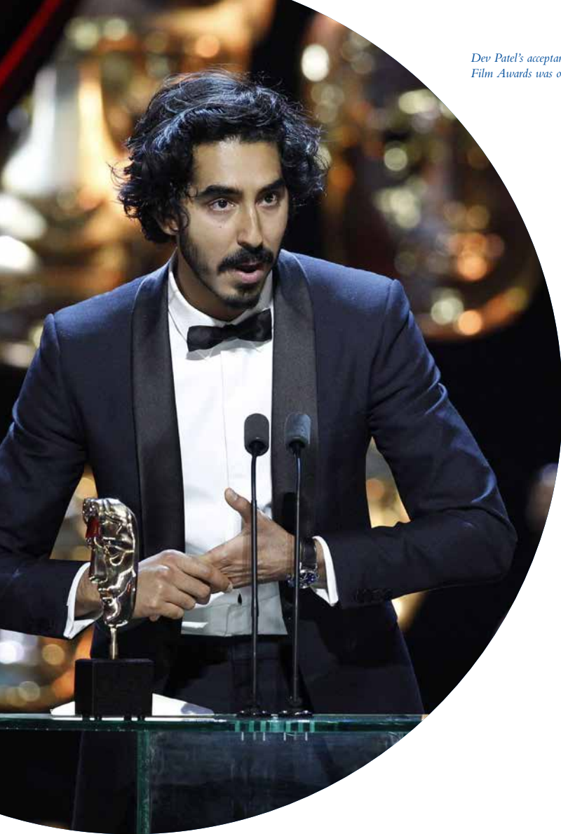
Dev Patel's acceptance speech for Supporting Actor at the Film Awards was our most watched YouTube video of the year