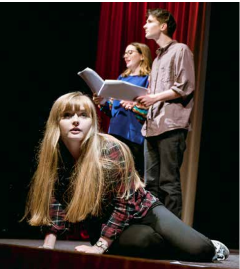
Top: BAFTA supported participants of the BFI NETWORK@FLARE mentorship programme; Above: Actors performing excerpts from the BAFTA Rocliffe New Writing Competition