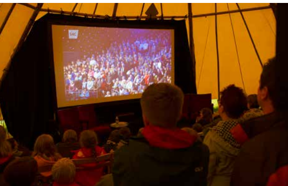
From top: Our wonderful children's hospice screenings rely on funds raised by our London Marathon runners; Our very exclusive Academy Circle events; Our Sinemaes activity was supported by the Arts Council Wales for the first time

Throughout the year, we hosted four events that offered BAFTA patrons the opportunity to spend a unique evening with a notable guest, providing greater insight into the craft of film and television and our charitable activities. The special guests were Sir David Attenborough, Joanna Lumley, the cast from The Crown and The Walking Dead star Andrew Lincoln.