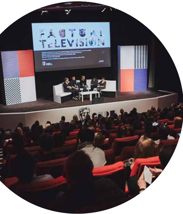
Above: A Guru Live session on factual television making in the Princess Anne Theatre at BAFTA 195; Opposite: The BAFTA 195 redevelopment plans

For 42 years, 195 Piccadilly has been BAFTA's home. The building has been revamped a few times over the years, to ensure it is fit for purpose and meets the high standards and ever-changing needs of the screen industries. In 2015, we announced plans for a major overhaul of the building to enable us to significantly expand our essential Learning & New Talent programme. We will create new multi-purpose learning spaces, a new screening room, an exhibition gallery and an improved home for our members.