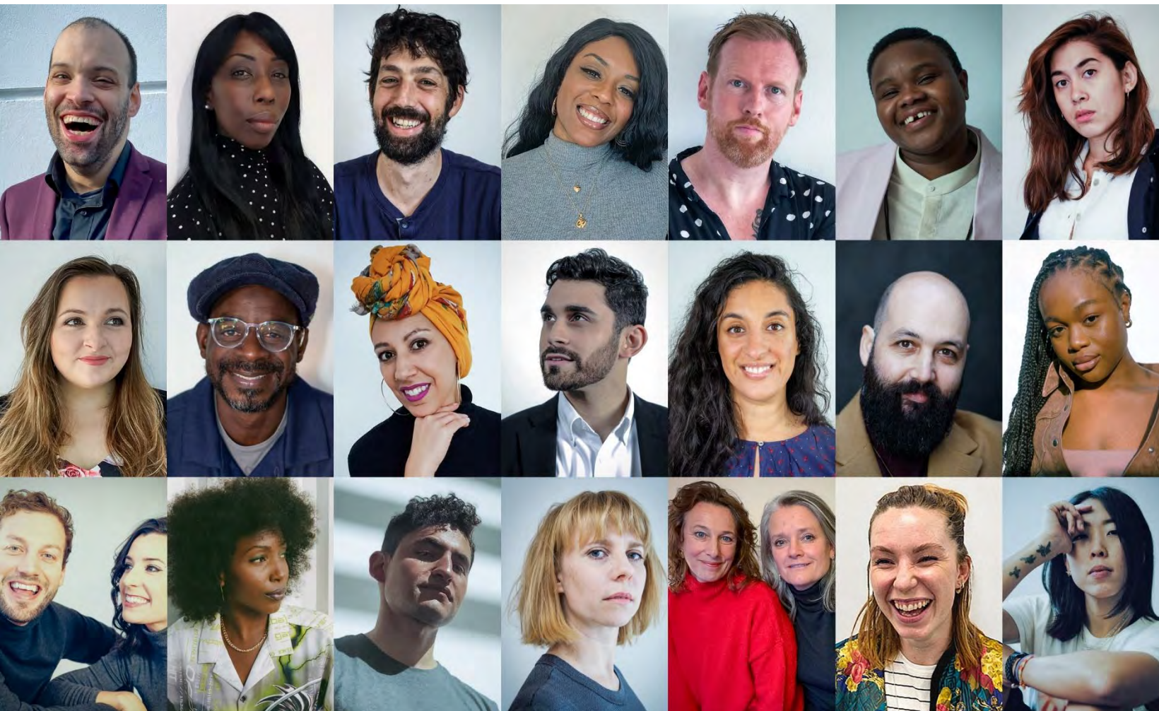
2020 BAFTA Breakthrough Brits