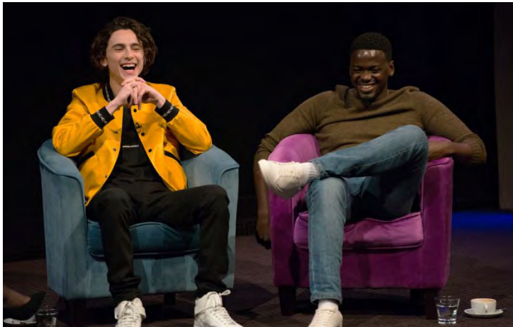
Above: Timothée Chalamet and Daniel Kaluuya, BAFTA Sessions.