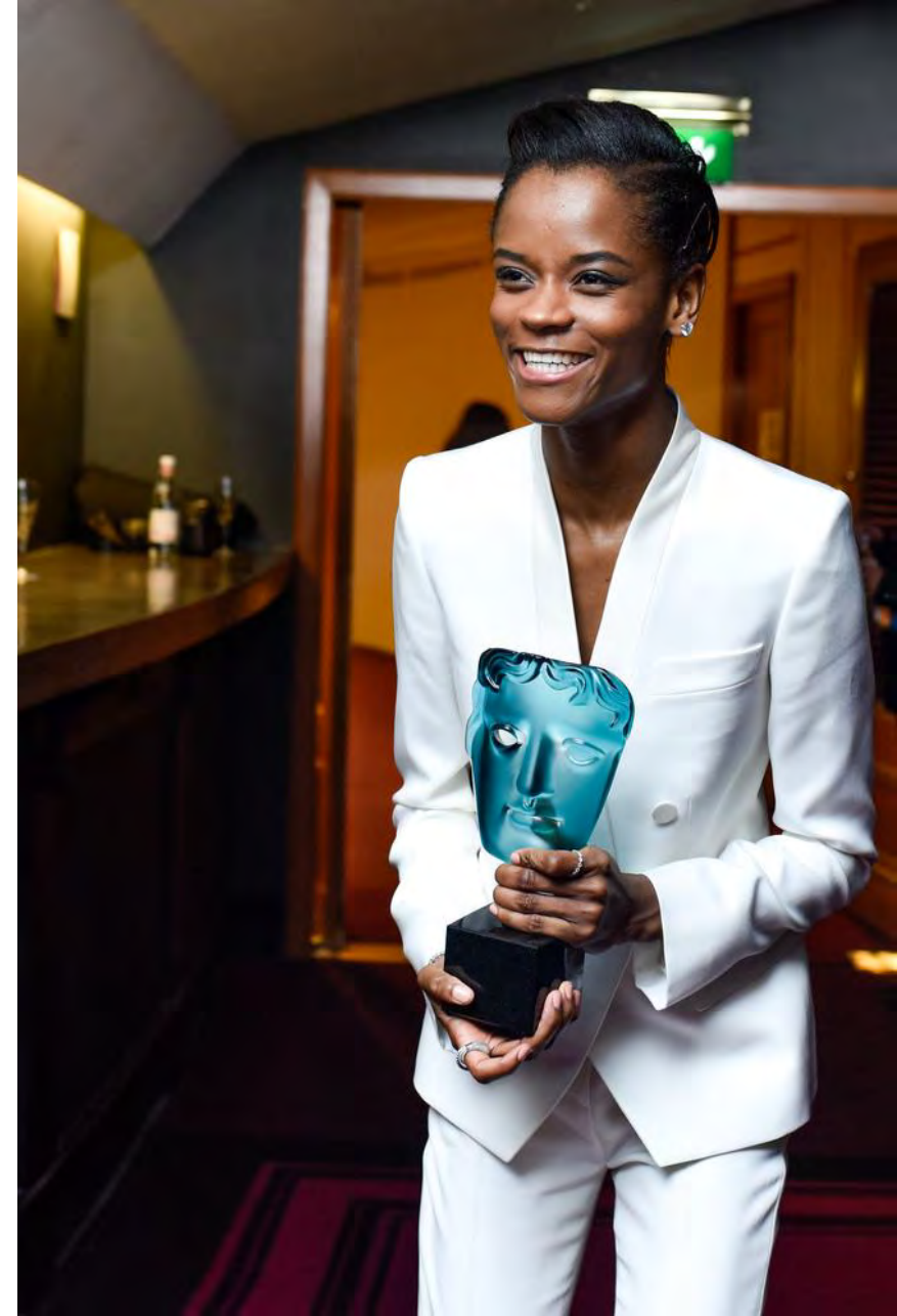
Former Breakthrough Brit Letitia Wright wins the EE Rising Star Award at the 2019 British Academy Film Awards

2015 Breakthrough Brit, 2019 EE Rising Star