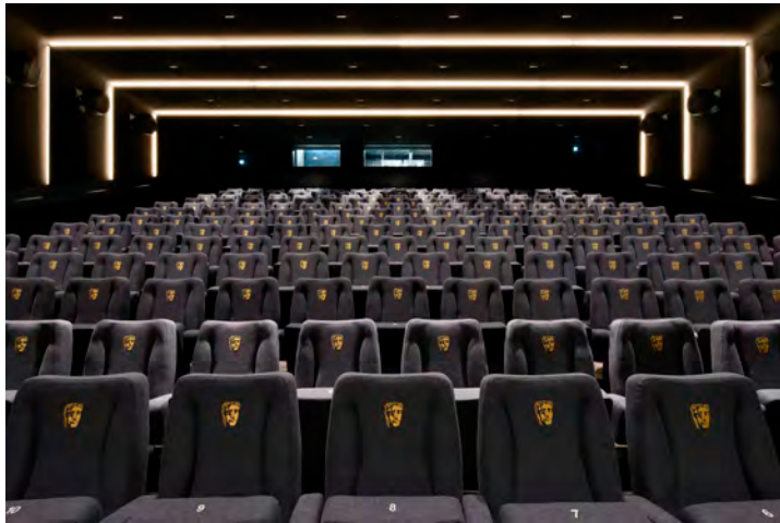
Above: Princess Anne Theatre interior 2021